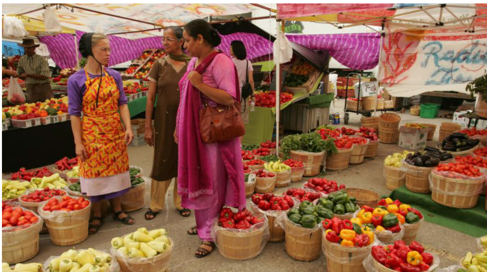
St. Jacobs Market