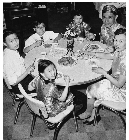
Fednews/Library and Archives Canada/PA-148765